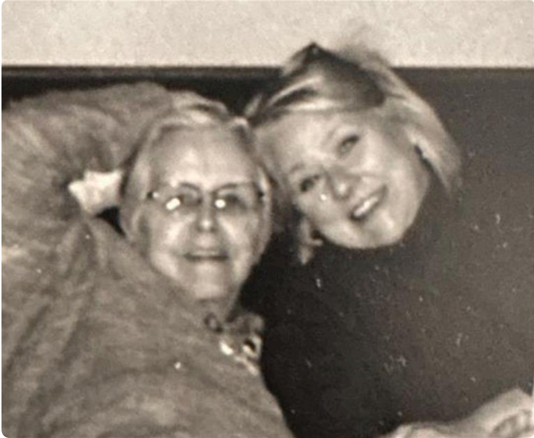
My favorite pic of the two of us